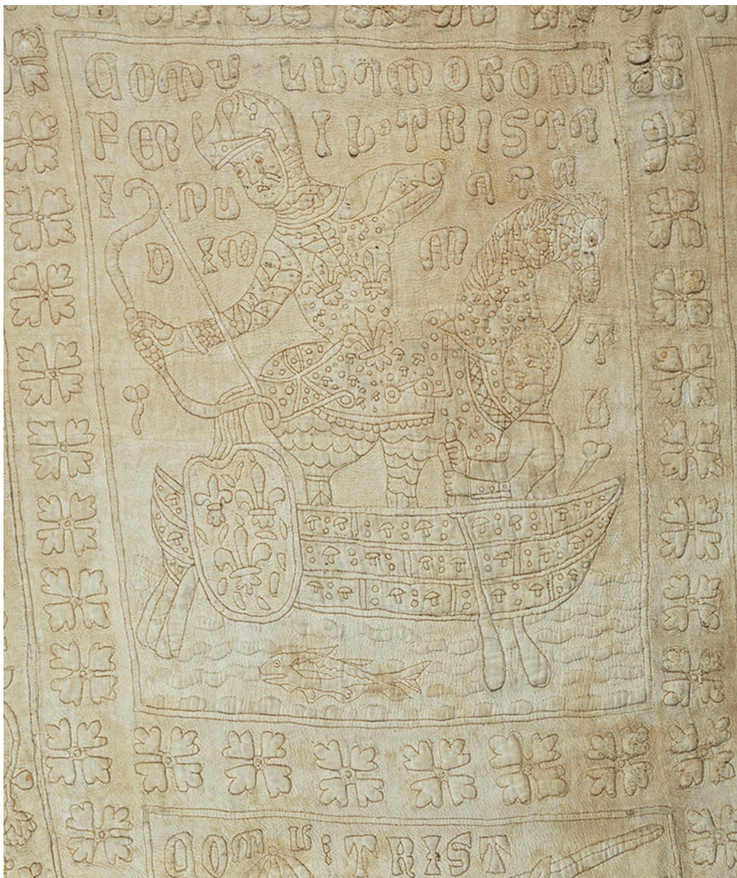
Detail from The Tristan Quilt, made in the 14th century, from the V&A